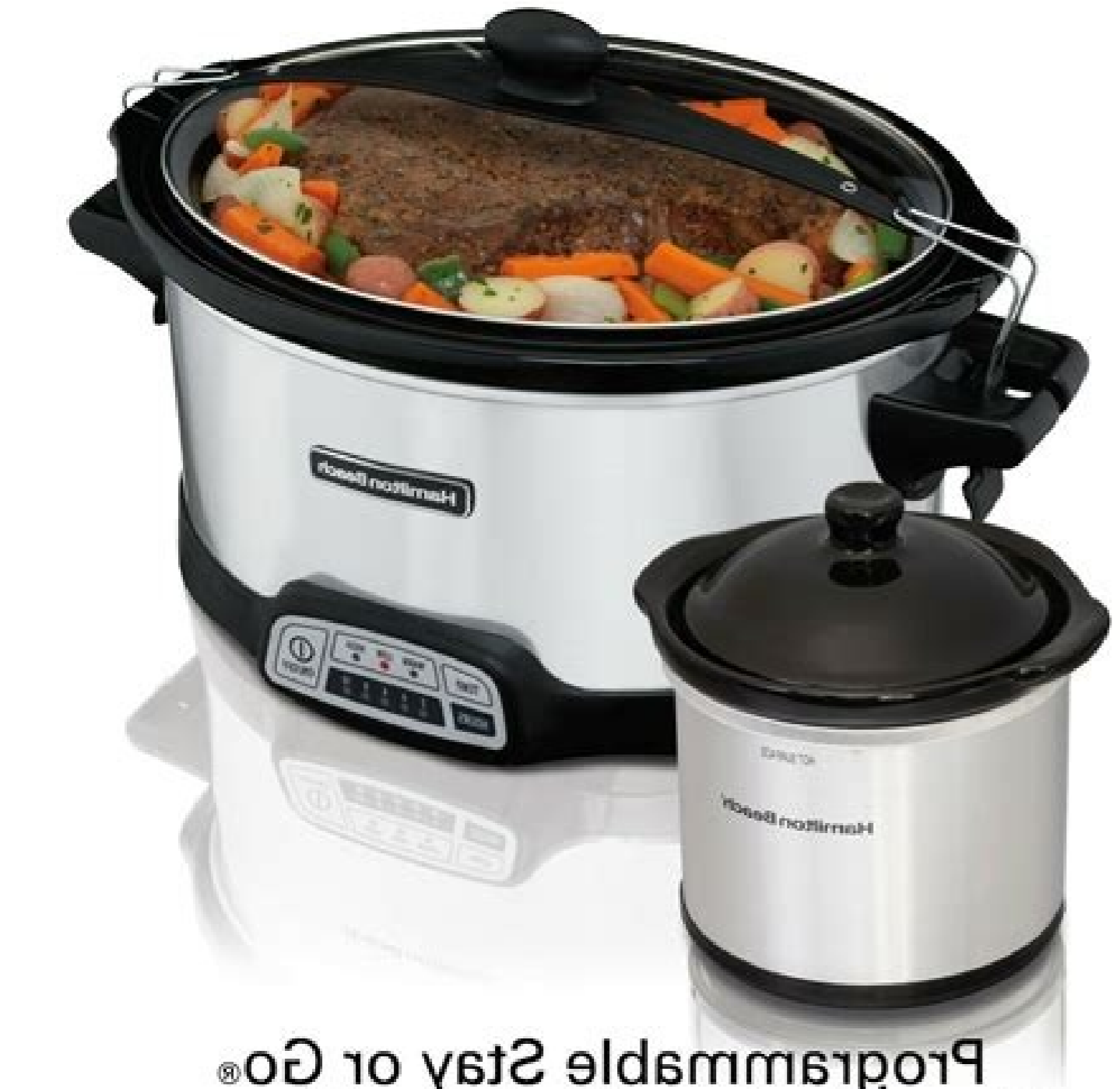
Slow Cooker with Party Dipper™ Programmable Stay or Go®